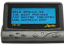
Table Pager TP-160